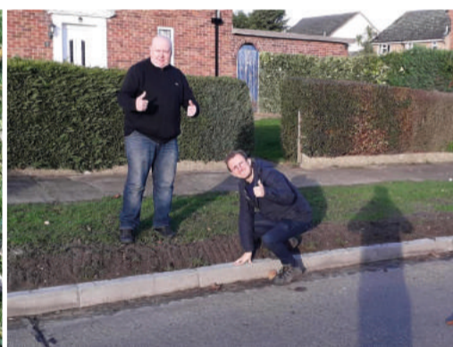
Leaves and pavement cleared on Montgomery Close