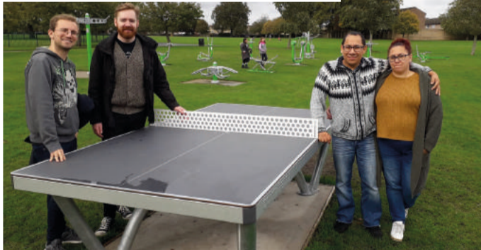
Paxman Park Christmas event part-funded by us