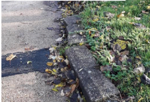
Kerbstones on Normandy Avenue repaired