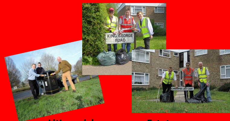
Litter picks on every Estate

Reporting issues that residents tell us about, and in some cases fixing them